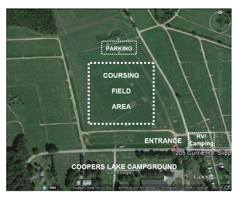
There will be yellow ASFA coursing signs from PA 422.